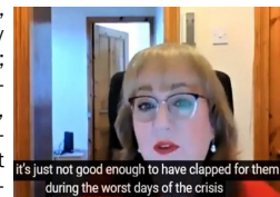
It's just not good enough to have clapped for them during the worst days of the crisis