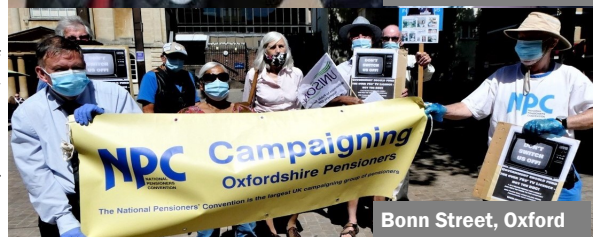
Bonn Street, Oxford